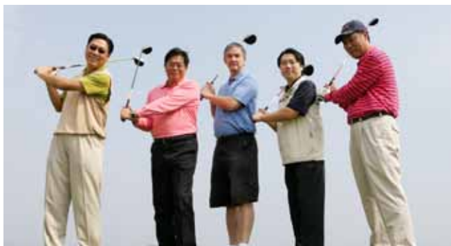
Golf players put their best club forward at the Bank of America Merrill Lynch golf day for OSC 2010.