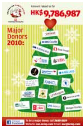
Logos of major donors for OSC 2010 featured on Christmas tree published in the City section of SCMP for the whole of December 2010.

OSC's continued effectiveness in helping the less fortunate would never have been possible without its generous long-term corporate supporters. Specific thanks must go to Swire (a donor of 15 years' standing), plus Bank of America Merrill Lynch, Five-A-Side Football Tournament, JP Morgan, Morgan Stanley and UBS AG (all donors of 10 years' standing).