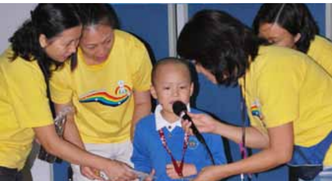
Child sharing at HK-China Cancer Children Cultural Exchange Camp organised by Little Life Warriors.

concepts of marine conservation were taught. Little Life Warriors "Growing Stronger, Going Further" motto was realised by organising a variety of programmes & activities for members in a patients' exchange camp in China. For the Families of SMA Charitable Trust, a therapist was employed to monitor and assess 12 severely disabled children and several items of medical equipment were bought for patients' use. The Intellectually Disabled Education and Advocacy League's Cyber Café in Action was successfully set up to train disabled persons and to train them on elementary service skills.