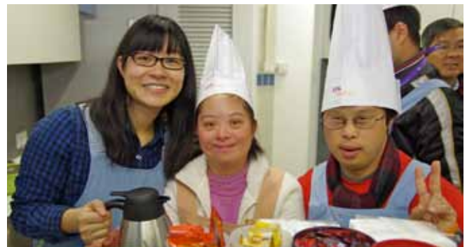
IDEAL Centre re-opening after renovation.