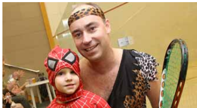
Father and son attend Operation Santa Claus 2010 - Wing Ding Squash Tournament in fancy dress at Hong Kong Football Club.