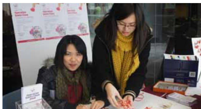
Hong Kong Baptist University's fundraising counter set up on Baptist University's campus.