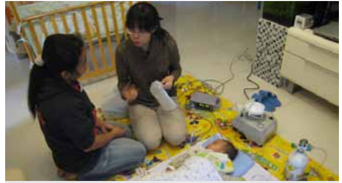
A therapist from Families of SMA Charitable Trust trains a carer to use life-saving medical machinery and rehearses emergency situation procedures.