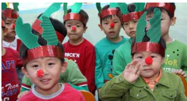
Kids from Korean International School participate in a fun fair to raise money for Operation Santa Claus 2010.

OSC 2010 also motivated some 300 individual donors to donate a total of HK$1,000,000 both on and offline.