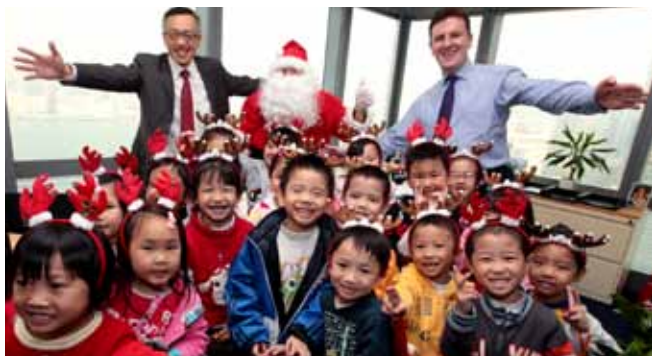
Beneficiaries meet Father Christmas at RBS Coutts.