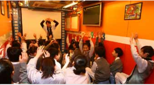
Students interact with an education officer at a talk given by the End Sexual Abuse Foundation.